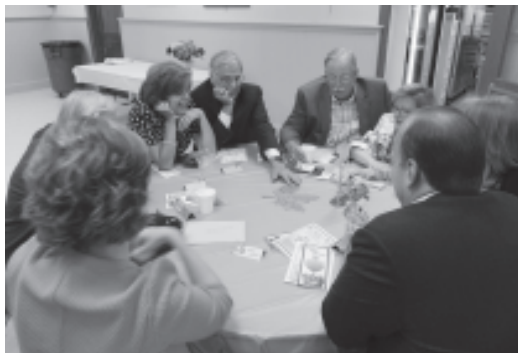
Participants putting together a Bible verse about God's promises at the Family Shield Dinner.

Some of the unchurched people who contact us are ready to be referred to a local congregation. That is easy follow-up! But many of those who contact us are not YET ready to be referred to a church. As we have expanded the program now heard on 51 stations in over 25 states and internationally, there have been more calls and more follow-up opportunities. Your support allows us to share God's love with those who contact us